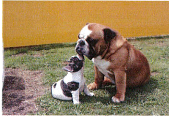
The Bulldog Club Combined Taskforce